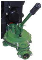
Manual hand pump available.