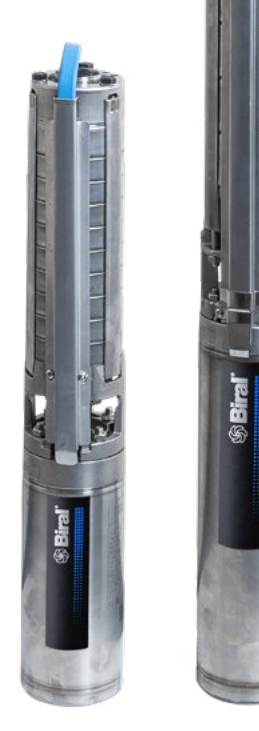
AquariA for vertical installation