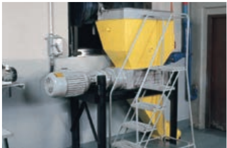
4-SHRED-H With Custom Hopper and Discharge Chute