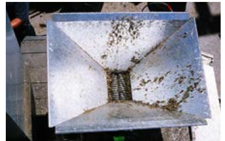
Customized Hopper Variations