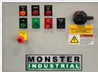
Model PC2220DS Standard Enclosure