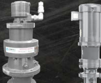
Optional Hydraulic Motors With or Without a Hydraulic Power Pack