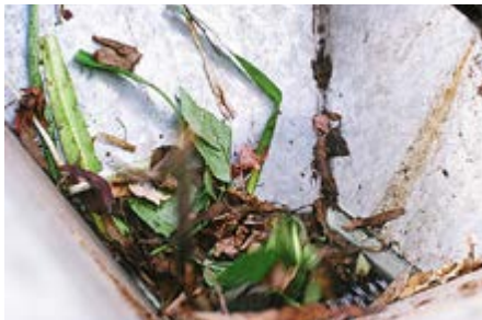
Shredding Food Waste