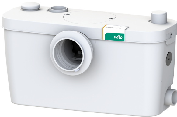
Wilo HiSewlift 3-35