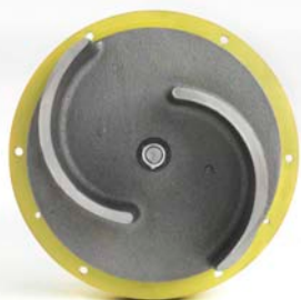
Monocal closed impeller