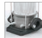
Oval flange Movitec V