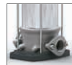
Oval flange Movitec VS