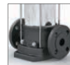
Round flange Movitec VCF