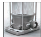
External thread con- nector Movitec VE