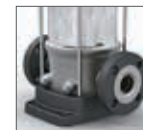
Round flange Movitec VF