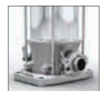
Triclamp coupling Movitec V(S)T