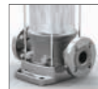
Round flange Movitec VSF