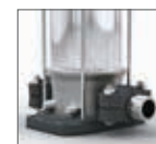
Victaulic coupling Movitec V(S)V