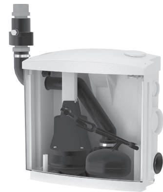
Hebefix extra (pump included in the scope of supply)

The unit is in conformity with the specifications of the DIN EN 12050 standard.